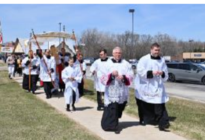
Palm Sunday Eucharistic procession